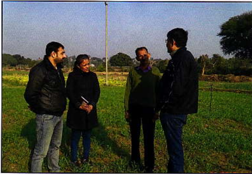
Plate-4: Impact Evaluation Study in progress