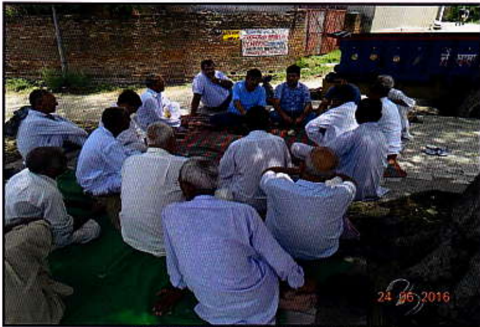
Plate-3: Meeting with farmers in progress