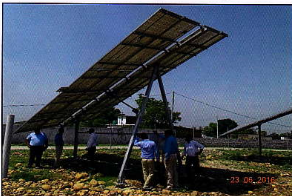
Plate-1: Inspection of Solar PV Panels in progress