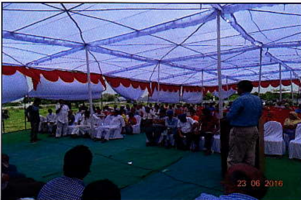
Plate-5: Field Day in Village Jugial