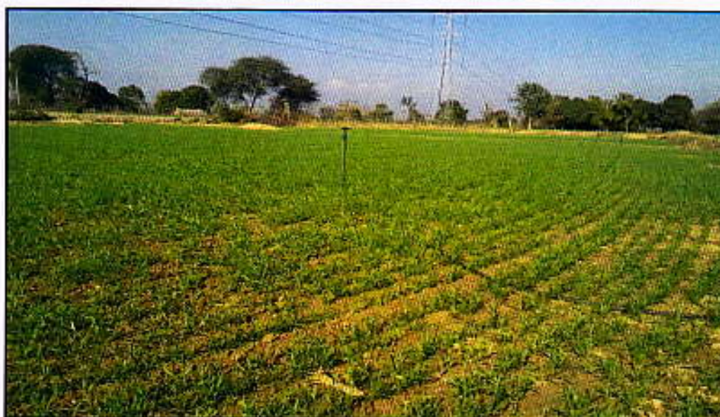
Plate-2: Wheat field in village Jugial

Precision Farming development Center (PFDC) has been involved in the training of farmers regarding use of micro irrigation for raising of crops including irrigation and fertigation schedules. The center is working in close coordination with the water users associations institutionalized in the project command. PFDC is also involved in capacity building of the field staff of the Department in the field of micro irrigation, solar photo voltaic pumping systems and operation and maintenance of the system.